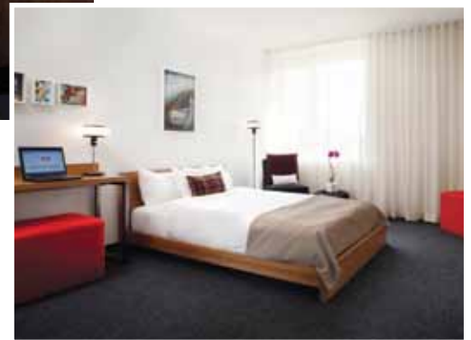
A preflight stay at the retro-chic Custom Hotel makes jet-setting fun again.

Sometimes travel includes carting home a bottle of the grape or Great-Aunt Edna's heirloom teacups (what, you're going to trust the post office?), and that involves multiple incantations to the baggage gods to keep that precious cargo from being smashed to smithereens. The new VinniBag ($28) is an inflatable air cushion that protects bottles or other breakables, whether traveling by plane, train, bus, or car. The one drawback: It's not a space-saving item when in use but it does deflate, fold, and stow when not; Wades Wines, Westlake Village, wadeswines.com.